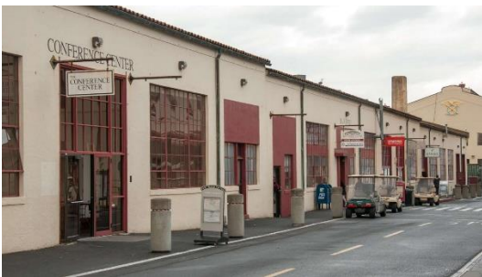
Photo of Fort Mason

to broaden our traditional notions of integrity and authenticity. A panel discussion followed that engaged the audience in the important questions of Heritage Conservation and place-keeping in our modern era. For example, is architectural integrity more important than the cultural significance of a property?