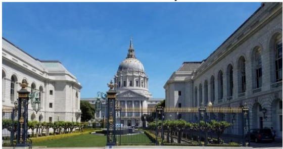
War Memorial Building, pictured left; City/County Hall, center; Opera House, right.

Our first session was a study tour of the San Francisco War Memorial Veterans building across from City Hall. Built in memory of WW I veterans in 1932, the Beaux-Arts building is now rededicated for all veterans. Historic events there include the 1945 signing of the United Nations Charter. The building's $120 million rehabilitation was driven by the need for seismic retrofitting and restoration of the historic interior serving veterans, the San Francisco Opera and the City of San Francisco Civic Center area.