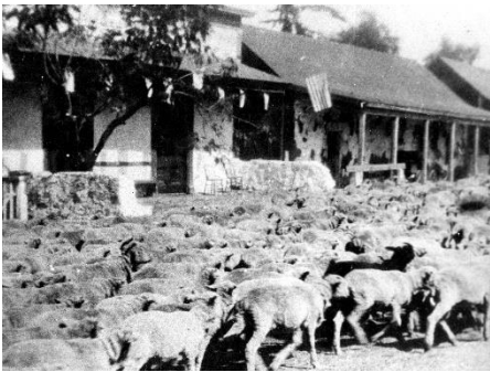
Sheep being herded through San Juan Capistrano late 1800s.