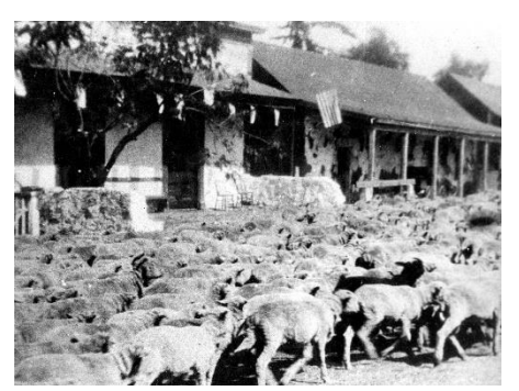
Sheep being herded through San Juan Capistrano late 1800s.