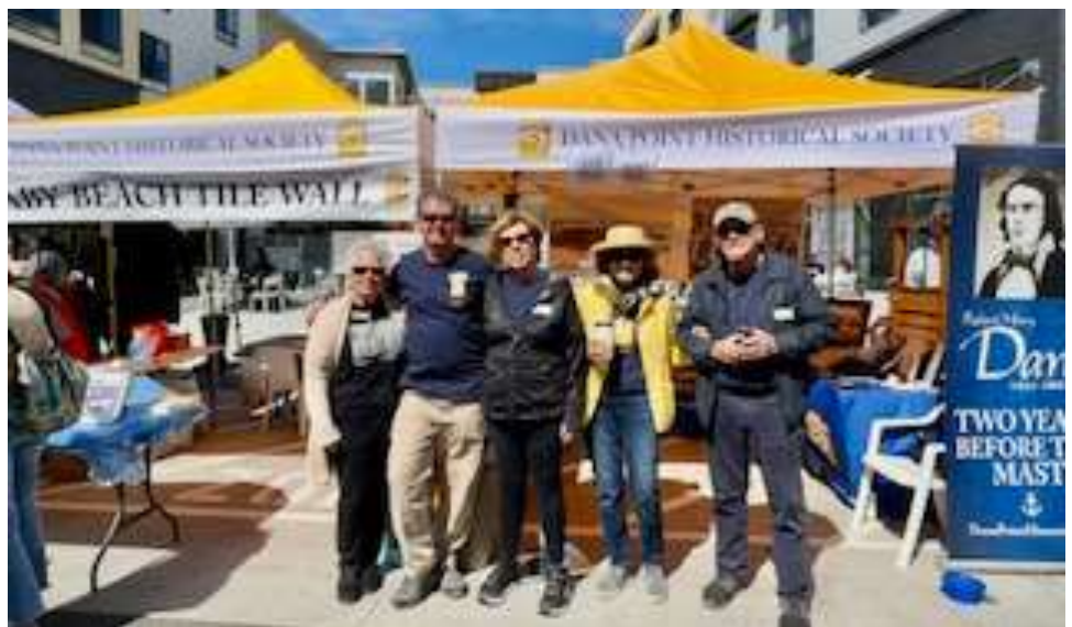
One group of several visitors preparing their tiles for the Baby Beach seawall.