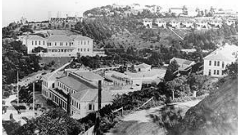
Angel Island

One exhibit there commemorated Asian-Americans who overcame barriers to excel, including Dr. Sammy Lee, a platform diver, who served in the U.S. Army Medical Corps after medical school and went on to be the first Asian American man ever to win an Olympic gold medal, which occurred in 1948. He followed that with another Olympic gold medal in 1952. Later, he coached young divers who won a total of 10 Olympic gold medals. A visit to Angel Island State Park is an easy 30-minute ferry ride across the bay from the historic San Francisco Ferry Building.