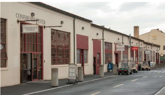
Photo of Fort Mason

The conference's Plenary Session discussed what we can learn from the world and UNESCO to broaden our traditional notions of integrity and authenticity. A panel discussion followed that engaged the audience in the important questions of Heritage Conservation and place-keeping in our modern era. For example, is architectural integrity more important than the cultural significance of a property?