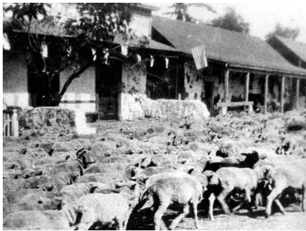
Sheep being herded through San Juan Capistrano late 1800s.