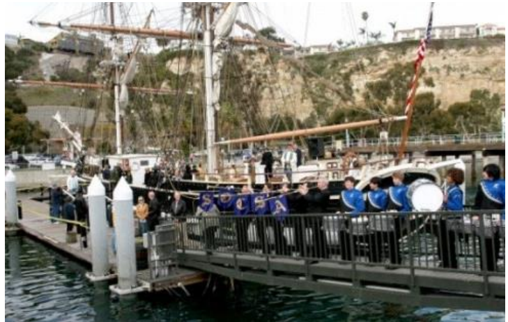
City of Dana Point's 20 th anniversary of incorporation in January, 2009.