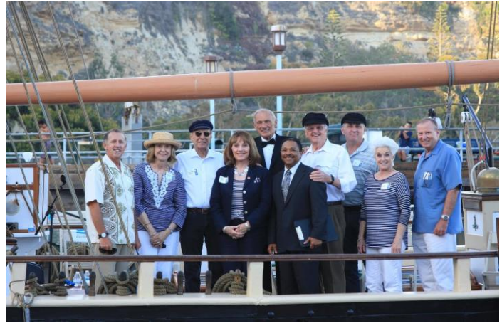
The brig Pilgrim on Sunday, March 29, 2020. On board, celebrating the 200 th birthday of Richard Henry Dana, 2015.

It is with great sadness that we share the disappointing loss of the beloved brig Pilgrim and its demise in Dana Point Harbor. Around 5 a.m. on Sunday, March 29, the Ocean Institute's ship was found keeled over and sinking. The Society remembers so many historic events taking place on board and dockside: our city's incorporation, our city's 20th anniversary, Dana's 200th birthday celebration, the Dana Point Symphony concert, the many student visits and all the historical re-enactments at the Ocean Institute's Tall Ships Festivals. It was tragic day for Dana Point citizens and for all those who visited her.