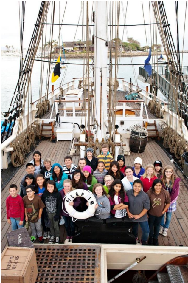
School children visited the Pilgrim over the course of many years.