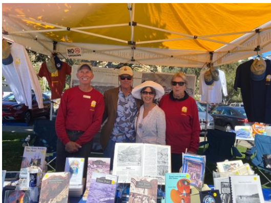
The Society's Festival of Whales Outreach Booth