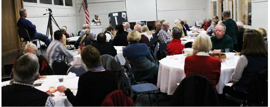
More than 60 people attended our January annual meeting and potluck.