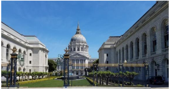
War Memorial Building, pictured left; City/County Hall, center; Opera House, right.

Our first session was a study tour of the San Francisco War Memorial Veterans building across from City Hall. Built in memory of WW I veterans in 1932, the Beaux-Arts building is now rededicated for all veterans. Historic events there include the 1945 signing of the United Nations Charter. The building's $120 million rehabilitation was driven by the need for seismic retrofitting and restoration of the historic interior serving veterans, the San Francisco Opera and the City of San Francisco Civic Center area.